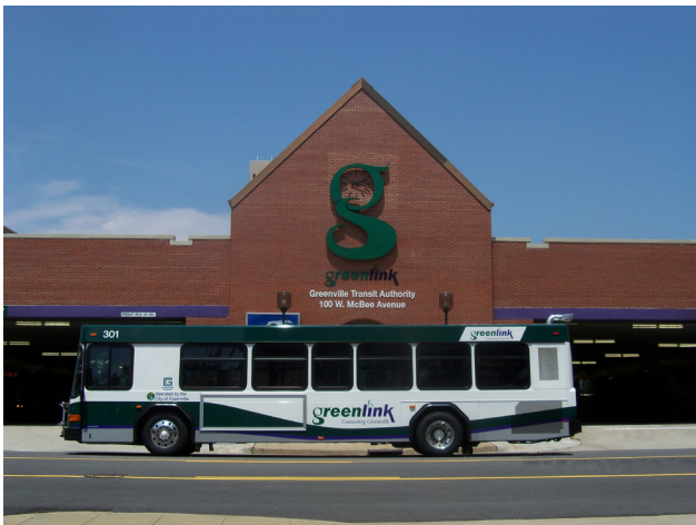
Seven new 35-foot Gillig buses like this one have joined Greenlink’s fleet

— From a News Release by the City of Greenville, SC on July 22, 2011.